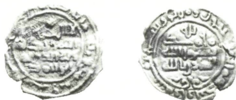
Enlarged x 1½

This coin is illustrated by permission of the Visitors of the Ashmolean Museum